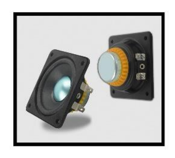
8 × 2.75" full range woofer with neodymium magnets