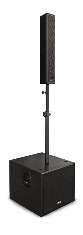
Iris 1 Column-type system of 880 W RMS. Composed by: 1 unit i 803 + 1 unit IT-A 115 B