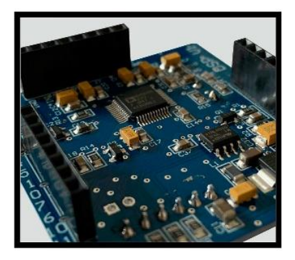
Last generation Class-D amplifier