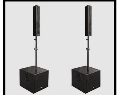
Extreme versatility for quick configurations