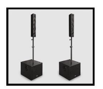
Extreme versatility for quick configurations