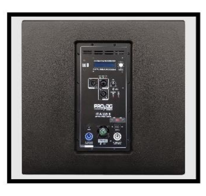
96kHz, 24 bit DSP processor with 3 factory presets. Speakon output for SAT.